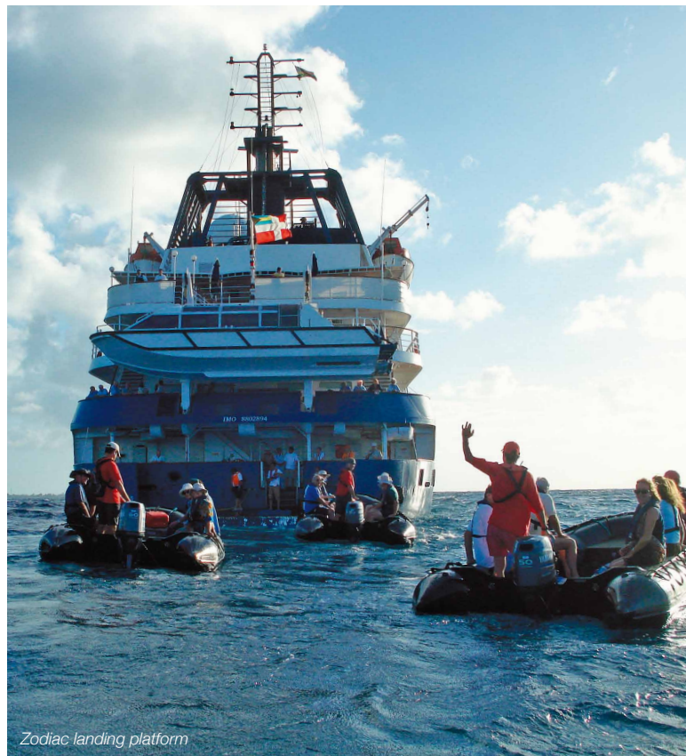
Zodiac landing platform