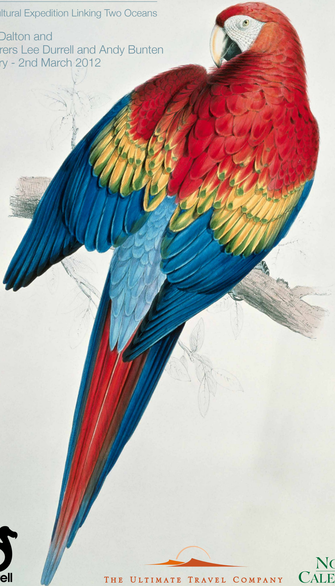
Red and Yellow Macaw by Edward Lear