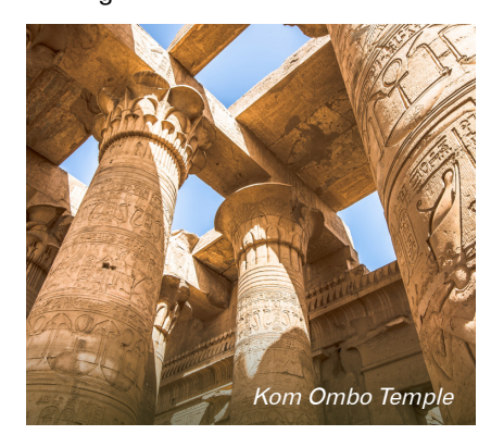
22 November Nile Cruise / Aswan

Lunch on board. Afternoon at leisure. Remain at Kom Ombo overnight. Dinner on board.