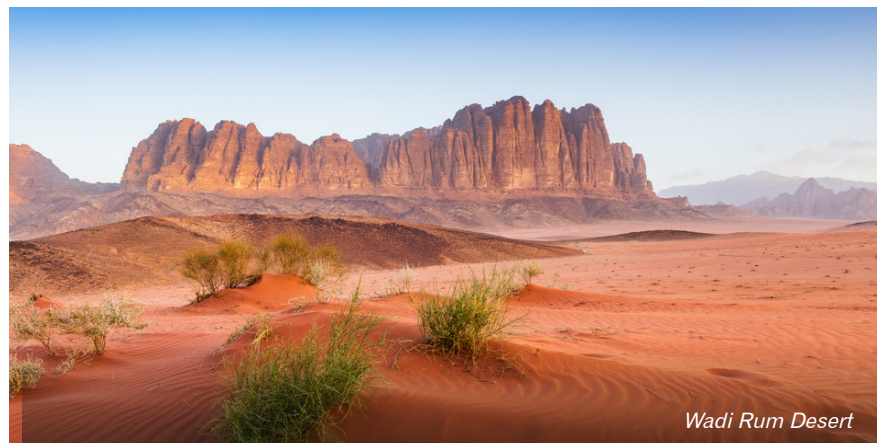
Wadi Rum Desert

Lunch in Kerak, before continuing to the ruins of the early 12th-century Shobak Castle, formally known as 'Mons Regalis', named in honour of the king's own contribution to its construction. Continue along the Desert Highway to Petra, a UNESCO World Heritage Site. Check into the Petra Marriott hotel, where three nights are spent. Located a short drive from the archaeological site of Petra, the hotel has spectacular views over the surrounding valley. Dinner in the hotel.