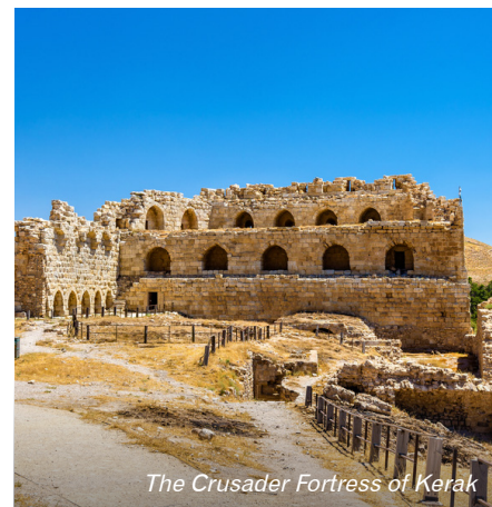
The Crusader Fortress of Kerak

Drive (with luggage) south to Kerak to visit the magnificent 12th-century Crusader fortress built by King Baldwin I of Jerusalem in 1142 AD and featured in legendary battles between the Crusaders and the Islamic armies of Saladin.