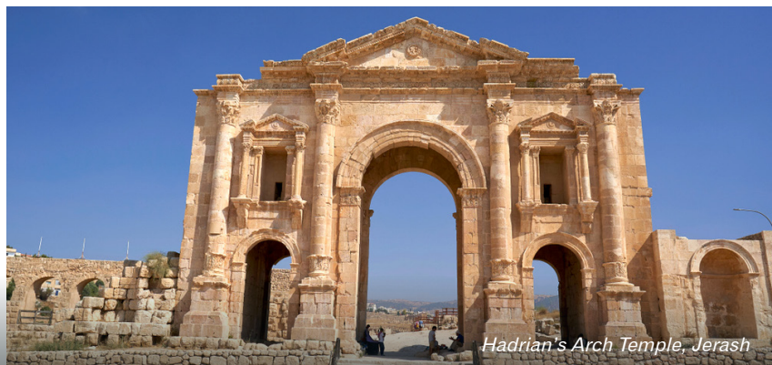
Hadrian's Arch Temple, Jerash