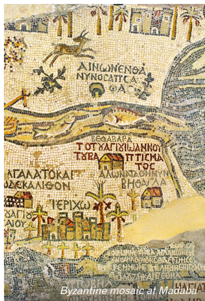
Byzantine mosaic at Madaba

Lunch at Haret Jdoudna restaurant, serving traditional Jordanian home-made dishes. Return to Amman for an afternoon at leisure. Dinner at Jafral restaurant.