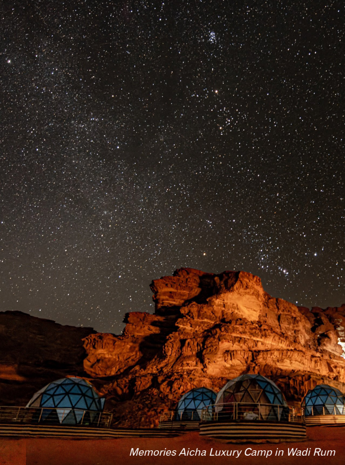
Memories Aicha Luxury Camp in Wadi Rum