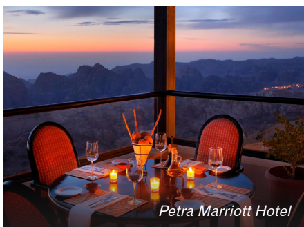
Petra Marriott Hotel

Lunch in Kerak, before continuing to the ruins of the early 12th-century Shobak Castle, formally known as 'Mons Regalis', named in honour of the king's own contribution to its construction. Continue along the Desert Highway to Petra, a UNESCO World Heritage Site. Check into the Petra Marriott hotel, where three nights are spent. Located a short drive from the archaeological site of Petra, the hotel has spectacular views over the surrounding valley. Dinner in the hotel.