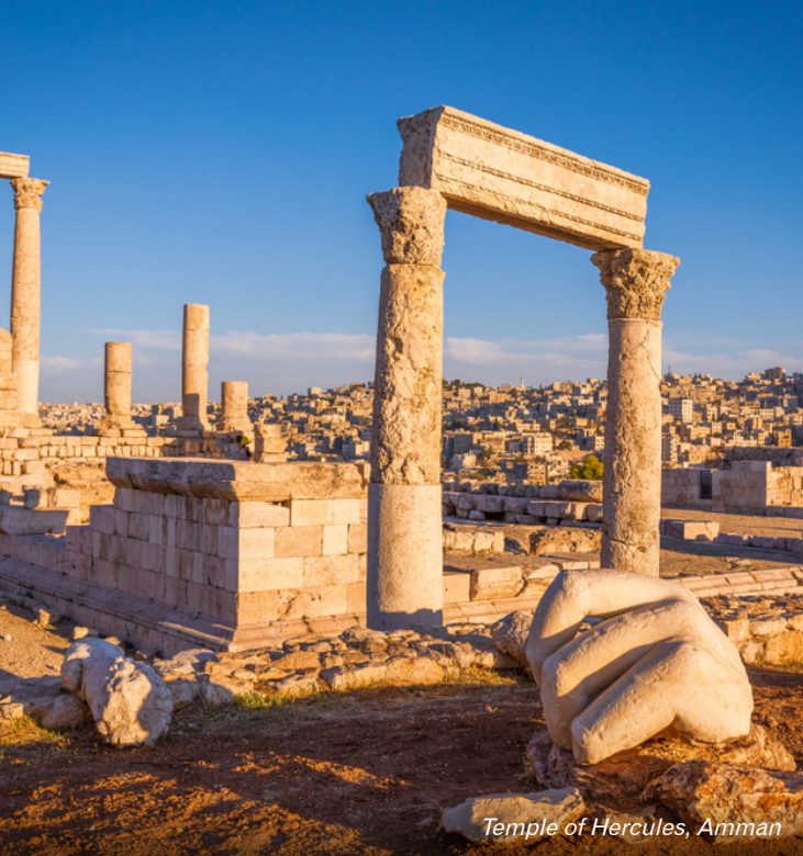
Temple of Hercules, Amman