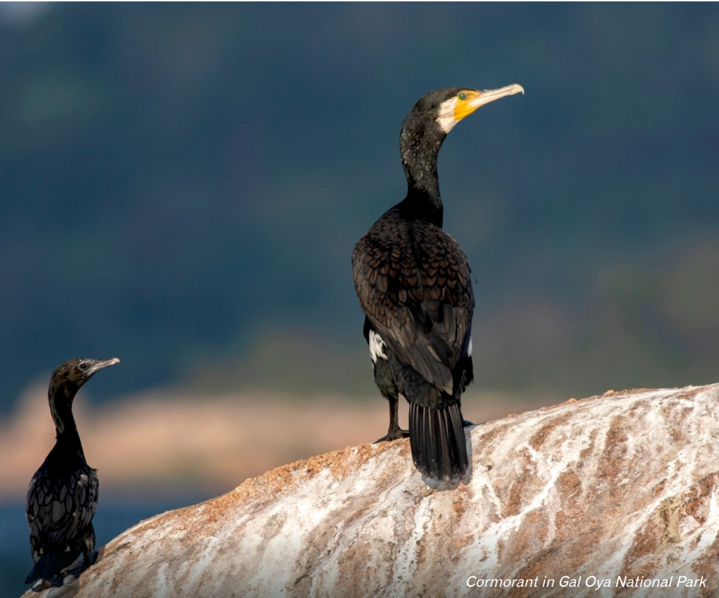
Cormorant in Gal Oya National Park