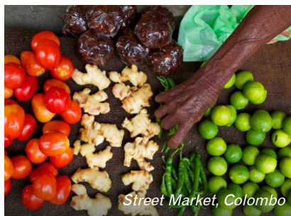
Street Market, Colombo

Lunch under own arrangements on arrival at the hotel. Afternoon at leisure. Late afternoon walk through the forest and terraced paddy fields to Mini World's End Point and Hatale Waterfall. Dinner at the hotel.