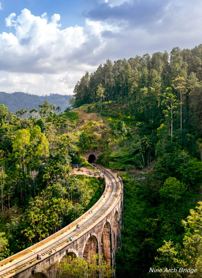
Nine Arch Bridge