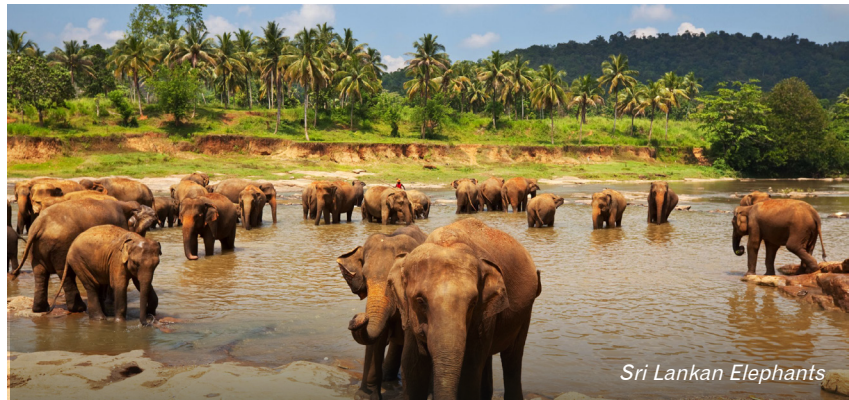
Sri Lankan Elephants