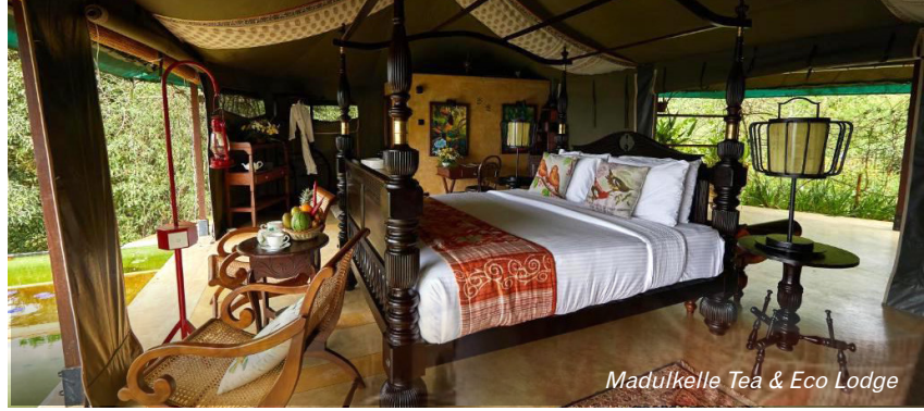
Madulkelle Tea & Eco Lodge