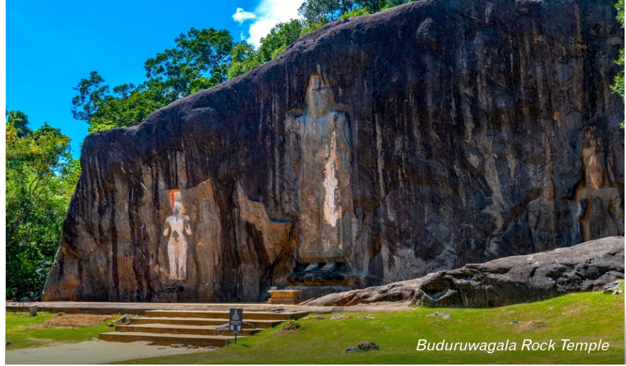
Buduruwagala Rock Temple