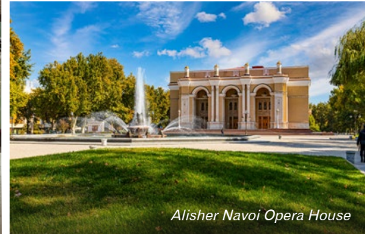
Alisher Navoi Opera House