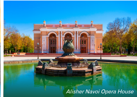
Alisher Navoi Opera House