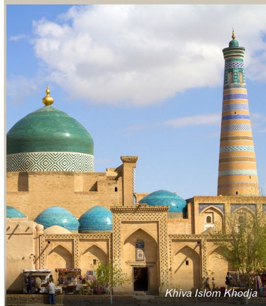
Khiva Islom Khodja