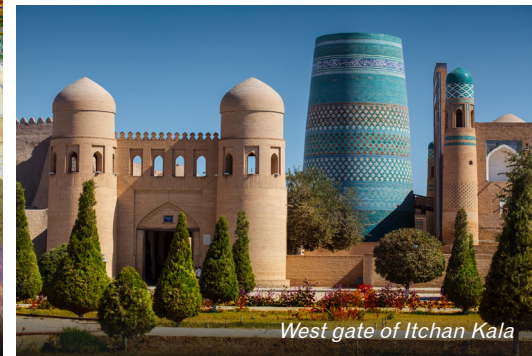
West gate of Itchan Kala