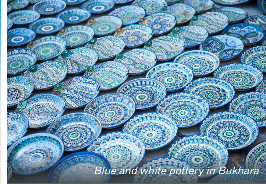
Blue and white pottery in Bukhara