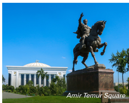
Amir Timur Square

and military leader and one of the founders of the Uzbek state. Welcome drink at the hotel before dinner at a local restaurant.