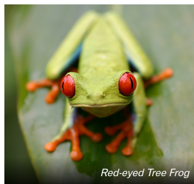
Red-eyed Tree Frog

Lunch at the lodge. Afternoon guided boat tour through the canals of Tortuguero National Park which shelters a fabulous array of wildlife, including more than 309 bird species, among them the great green macaw, 57 species of amphibians, 111 species of reptiles, 3 species of marine turtles, 30 species of fresh water fish and 60 mammal species. Dinner at the lodge.