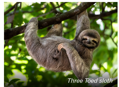
Three Toed sloth

sights and sounds of the jungle and the lapping ocean. Dinner at the lodge.