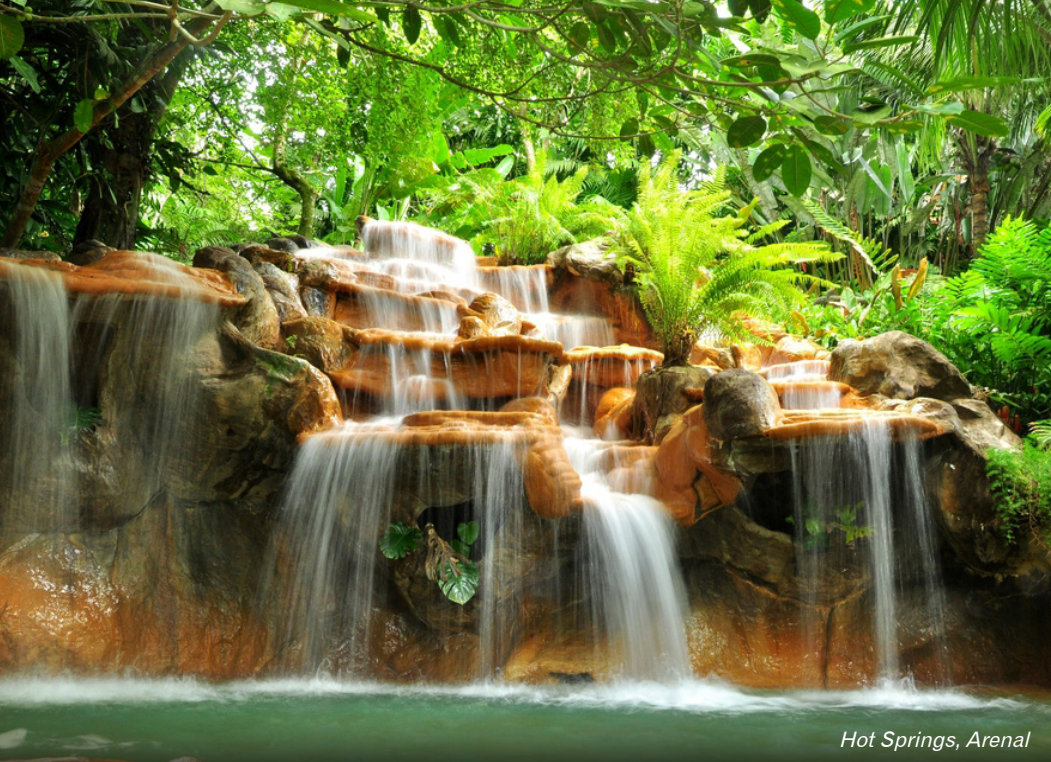
Hot Springs, Arenal