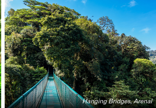
Hanging Bridges, Arenal