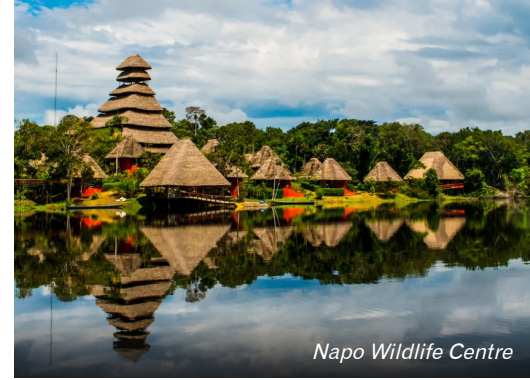
Napo Wildlife Centre