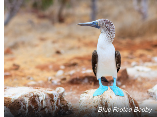
Blue Footed Booby

common stilts, pintail ducks, and other species of birds. Pass through a Scalesia tree forest; endemic to the area, as there are only 400 specimens of Scalesia trees left in the world.