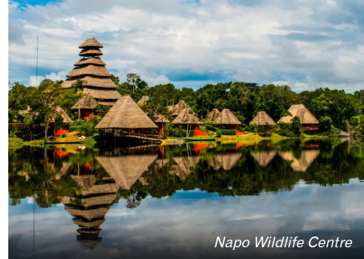
Napo Wildlife Centre