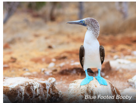
Blue Footed Booby

common stilts, pintail ducks, and other species of birds. Pass through a Scalesia tree forest; endemic to the area, as there are only 400 specimens of Scalesia trees left in the world.