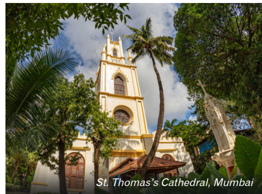
St. Thomas's Cathedral, Mumbai

built 225 years ago as a residence of the rulers of Samode. It is set in a verdant garden with rooms arranged around a series of intimate courtyards and facilities include a large Moorish-style pool and a spa offering a range of massages.