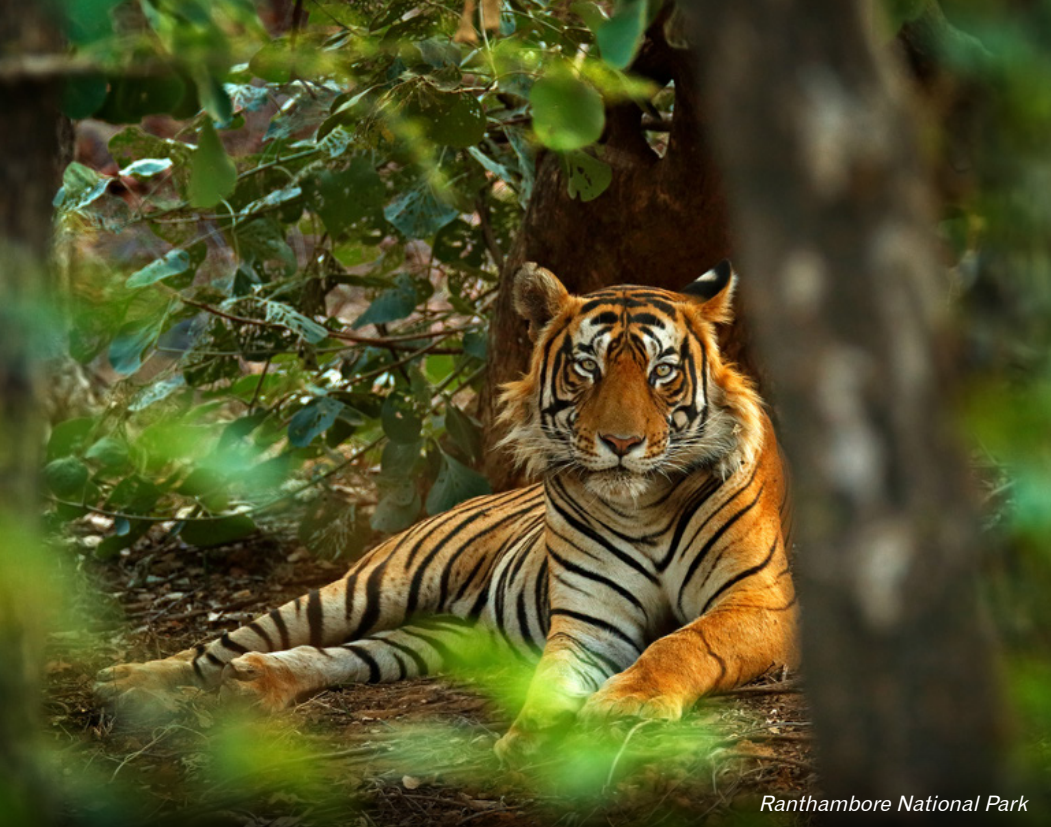
Ranthambore National Park