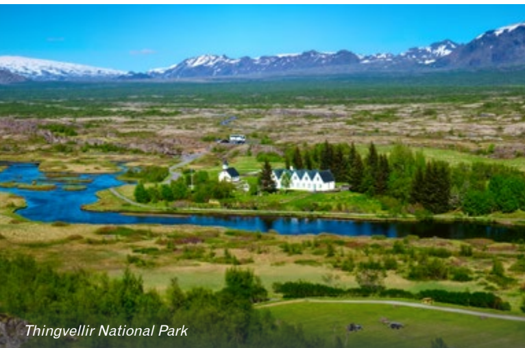
Thingvellir National Park