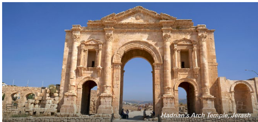
Hadrian's Arch Temple, Jerash