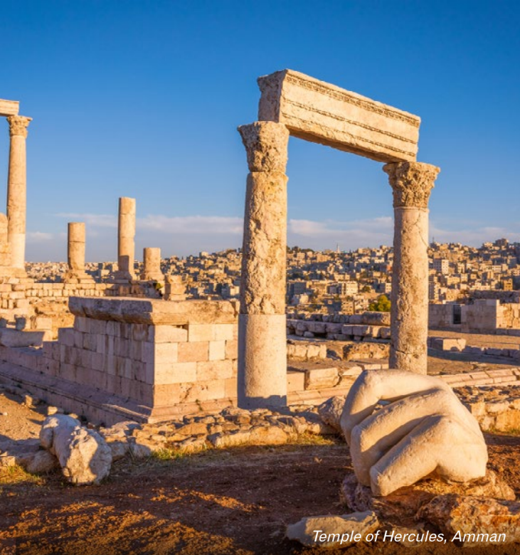
Temple of Hercules, Amman