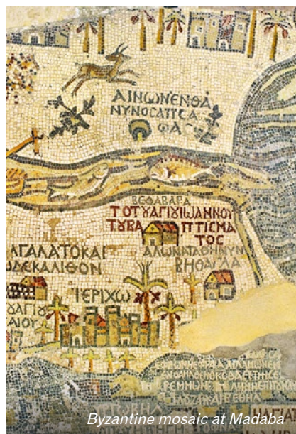
Byzantine mosaic at Madaba

Lunch at Haret Jdoudna restaurant, serving traditional Jordanian home-made dishes. Return to Amman for an afternoon at leisure. Dinner at Jafral restaurant.