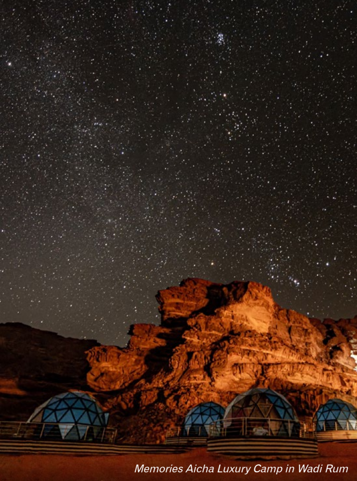
Memories Aicha Luxury Camp in Wadi Rum