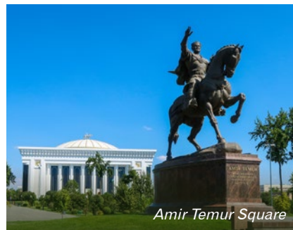
Amir Timur Square

of Amir Timur, the great statesman and military leader and one of the founders of the Uzbek state. Welcome drink at the hotel before dinner at a local restaurant.