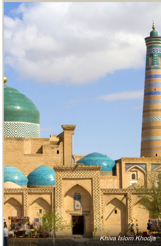
Khiva Islom Khodja