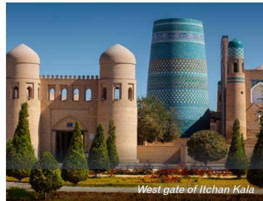
West gate of Itchan Kala