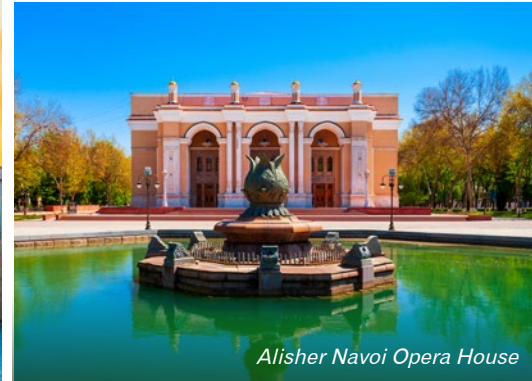
Alisher Navoi Opera House