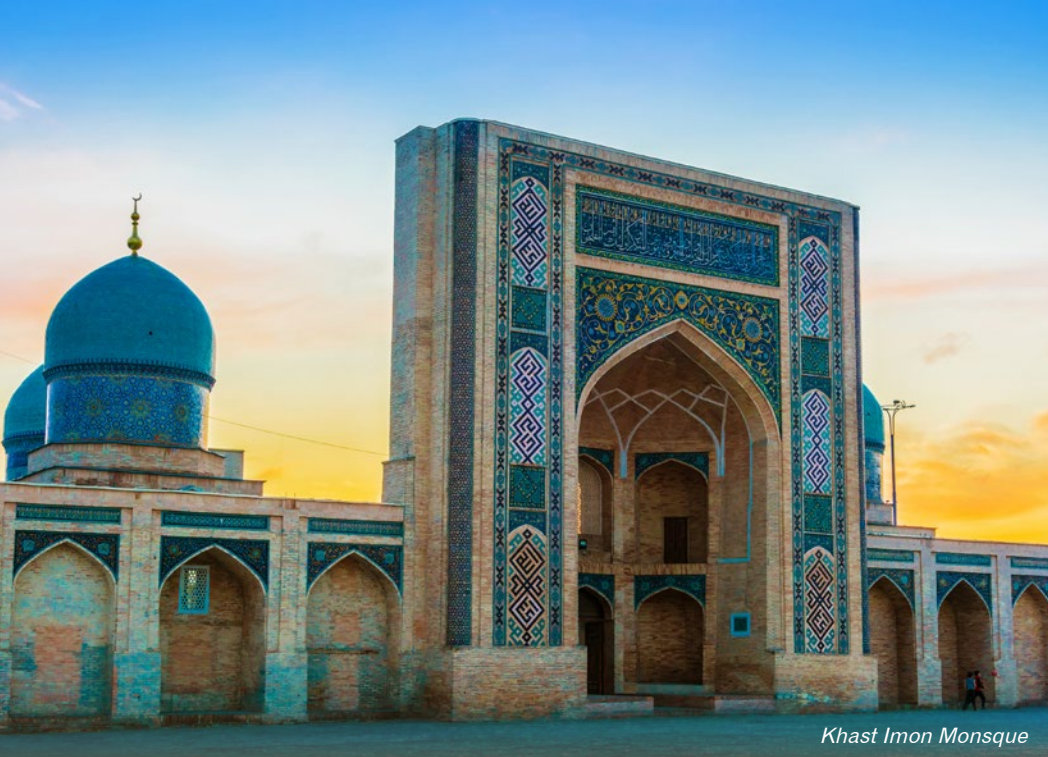
Khast Imom Mosque