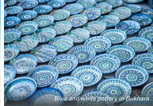
Blue and white pottery in Bukhara