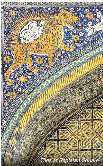
Tiles at Registan Square

Group transfer to Tashkent Airport for suggested (not included) Turkish Airlines flight via Istanbul departing Tashkent at 09.00 hrs arriving London Heathrow at 16.45 hrs.