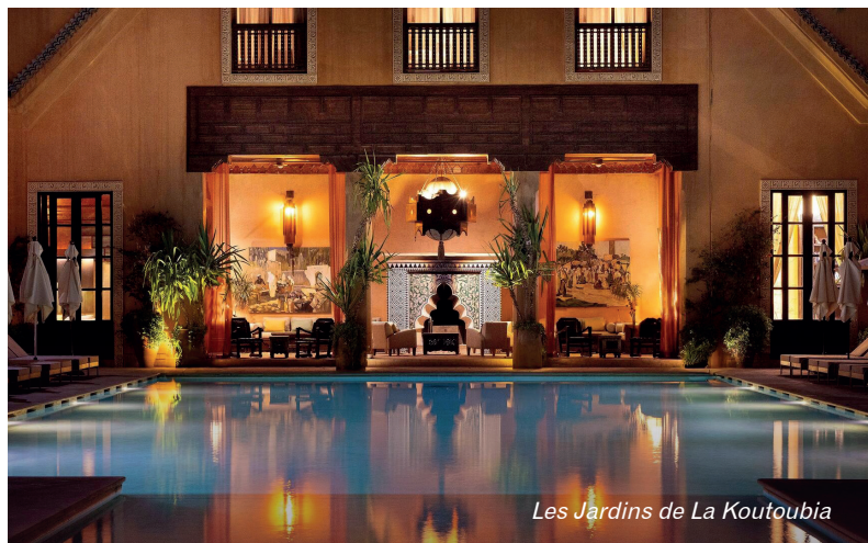
Les Jardins de La Koutoubia