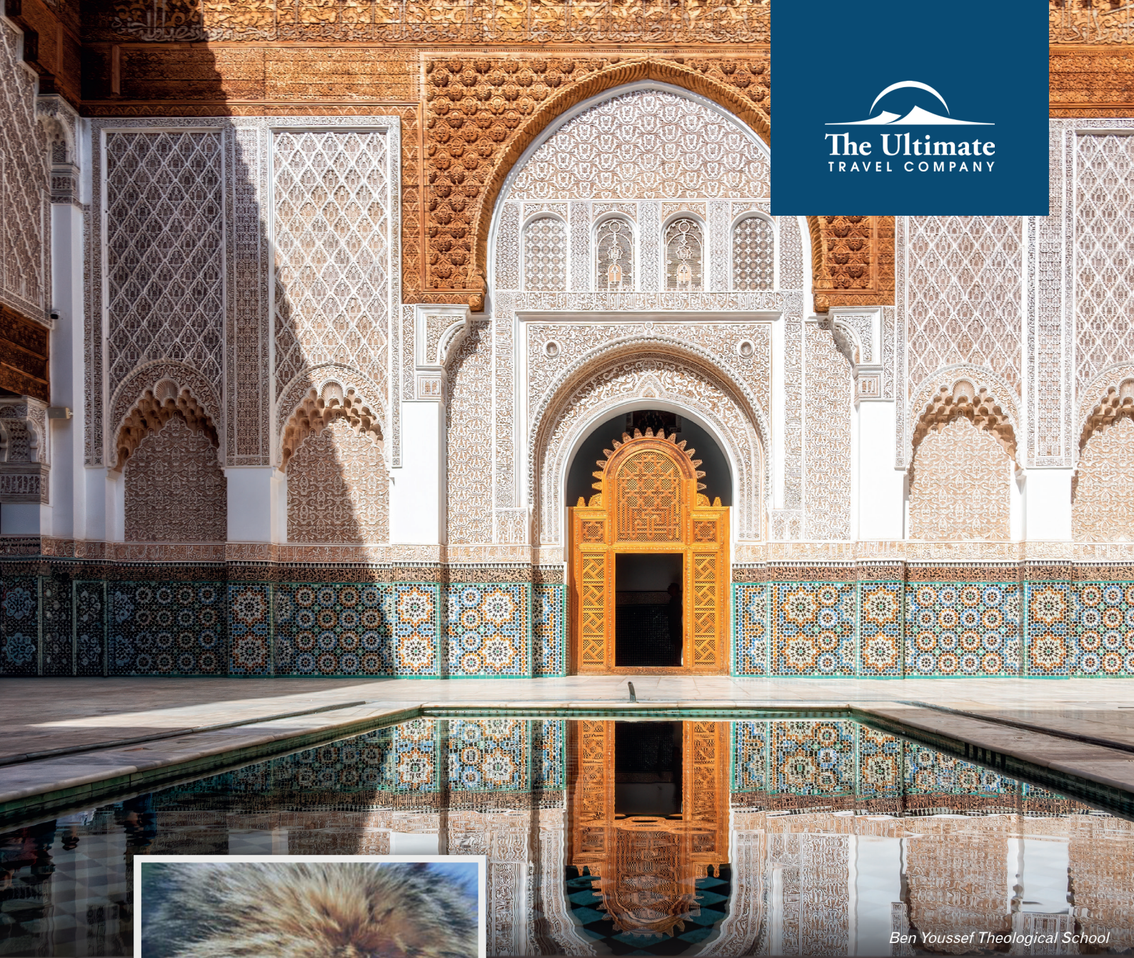
Ben Youssef Theological School