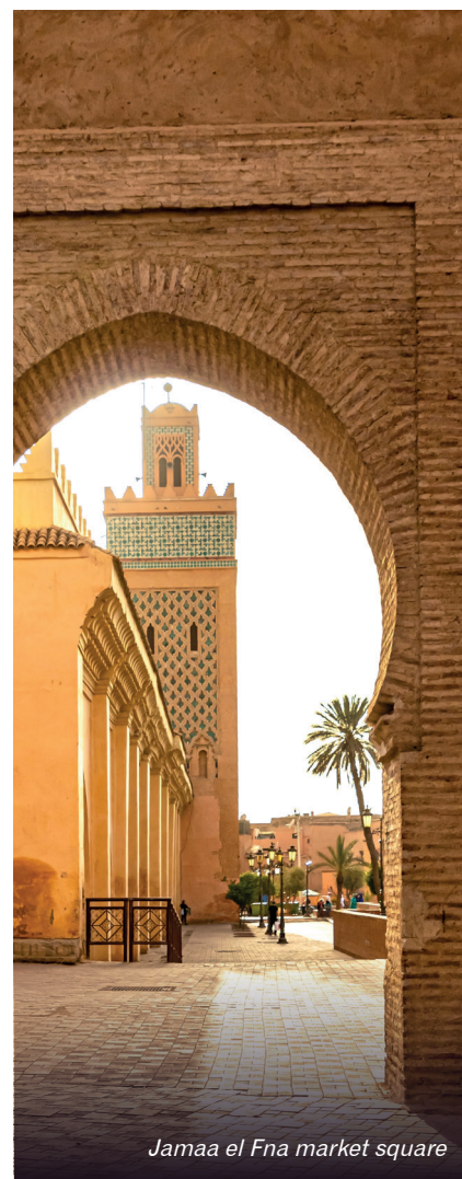
Jemaa el Fna market square