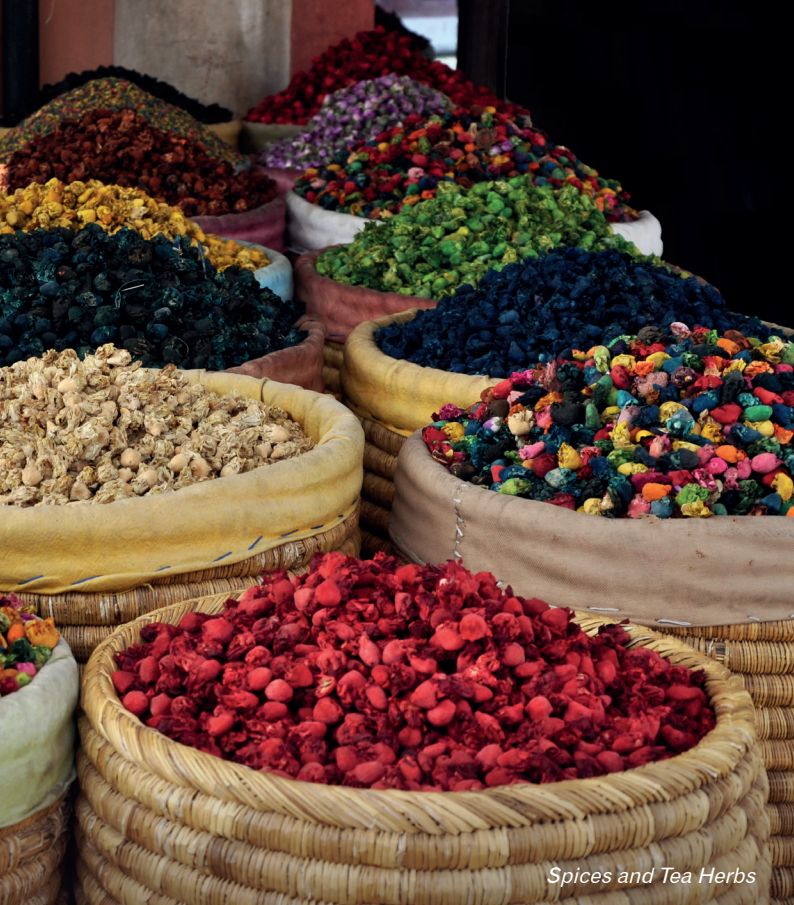
Spices and Tea Herbs