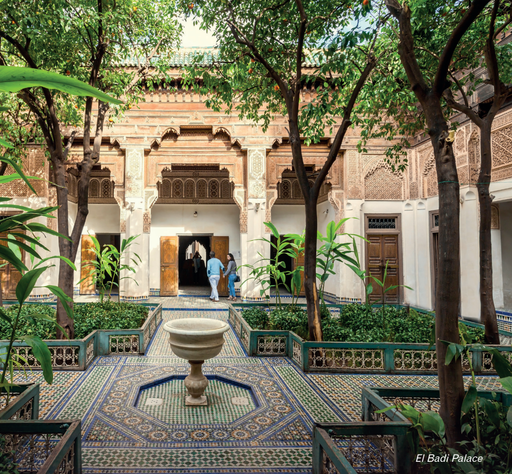
El Badi Palace