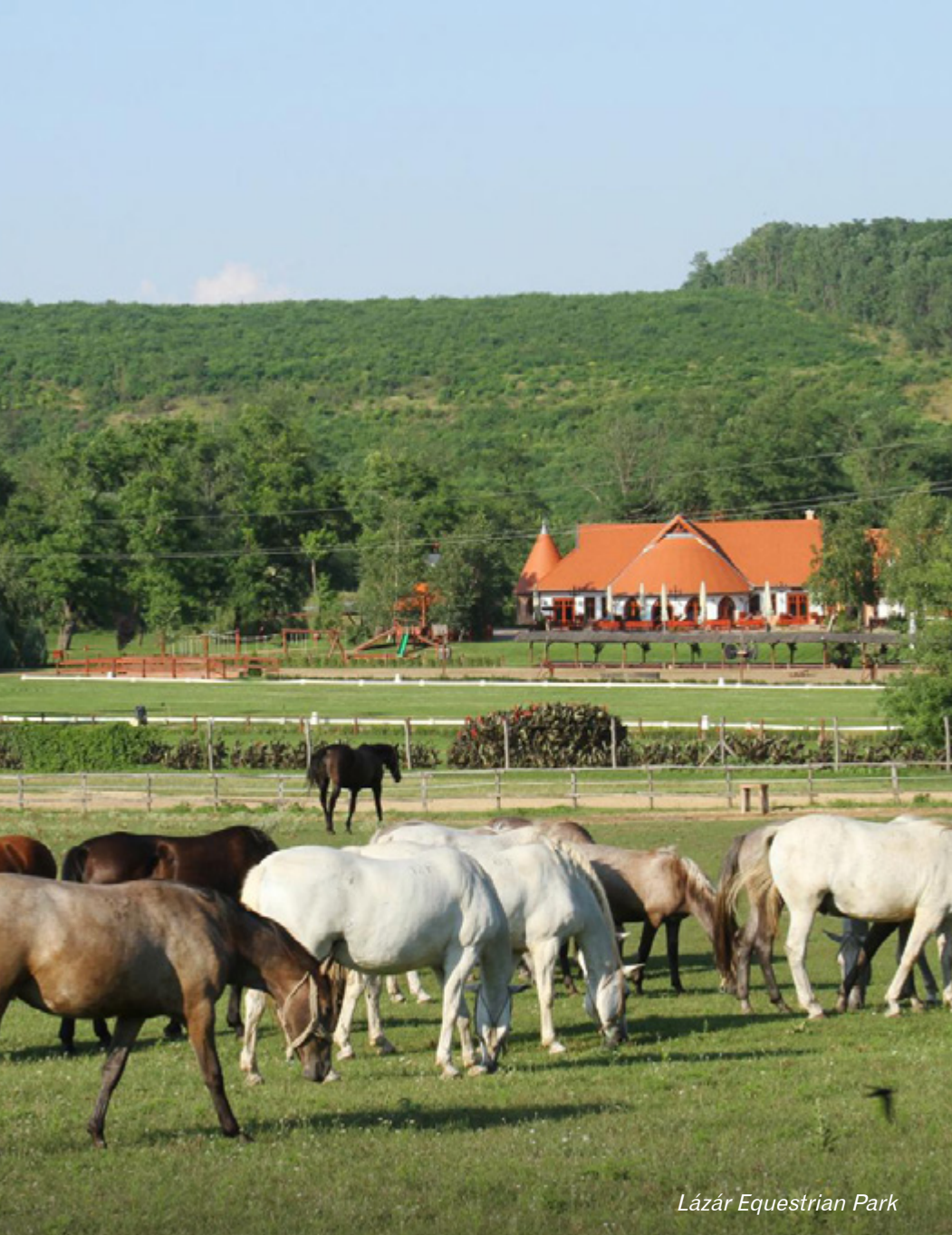
Lázár Equestrian Park