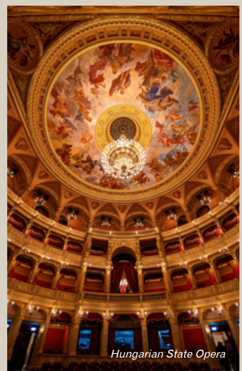
Hungarian State Opera