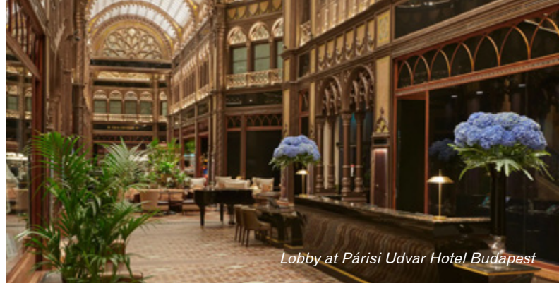
Lobby at Párisi Udvar Hotel Budapest