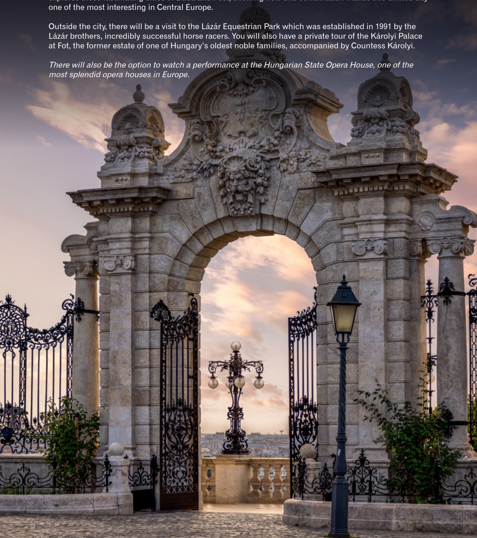
Gates at Buda Castle

There will also be the option to watch a performance at the Hungarian State Opera House, one of the most splendid opera houses in Europe.