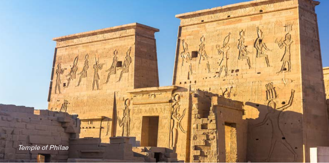
Temple of Philae