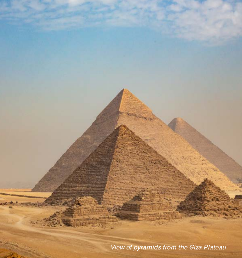
View of pyramids from the Giza Plateau