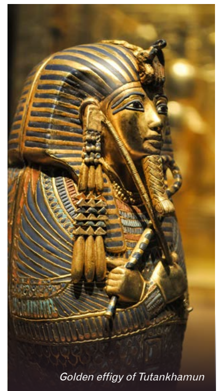
Golden effigy of Tutankhamun

statues of the pharaohs and avenues of sphinxes, which cover a vast area – the result of continuous building for over a thousand years. Then continue to the Temple of Luxor, which developed over many centuries, built overlooking the Nile and is dedicated to the god Amun. Dinner on board.