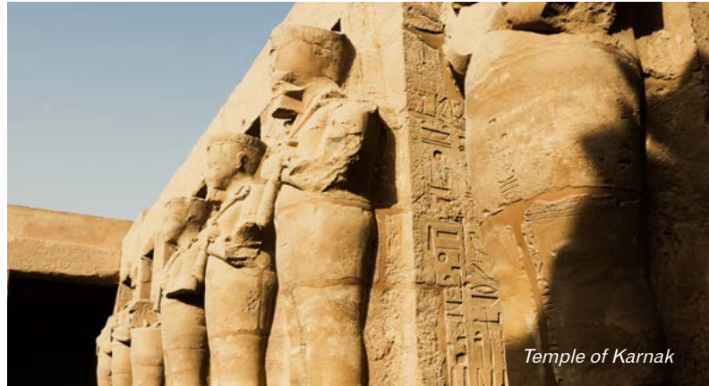
Temple of Karnak