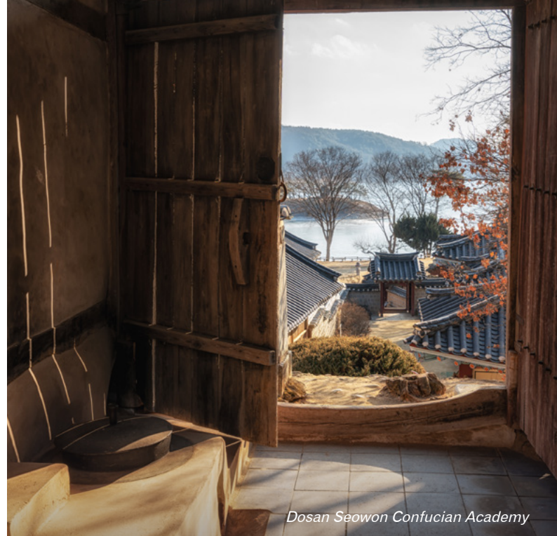
Dosan Seowon Confucian Academy