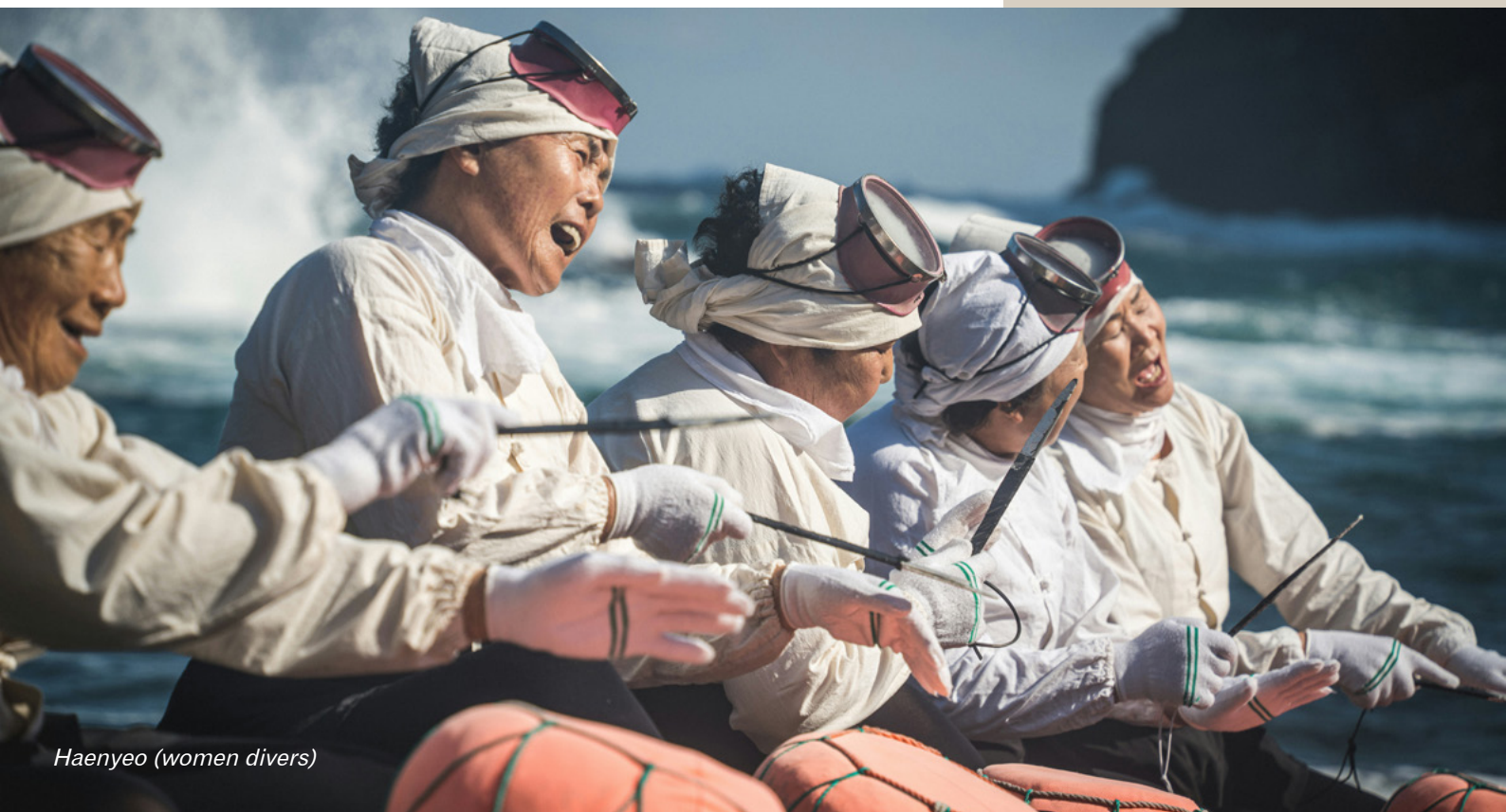
Haenyeo (women divers)