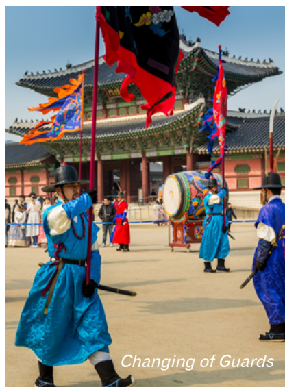
Changing of Guards

Group transfer to Seoul Airport. Suggested flight (not included) Korean Air KE 907 departing Seoul Incheon International at 10.55 hrs arriving London Heathrow at 17.20 hrs.