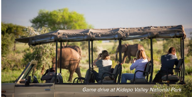
Game drive at Kidepo Valley National Park