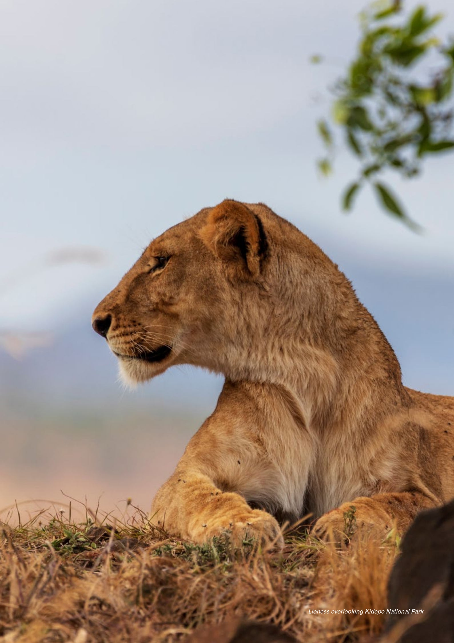
Lioness overlooking Kidepo National Park