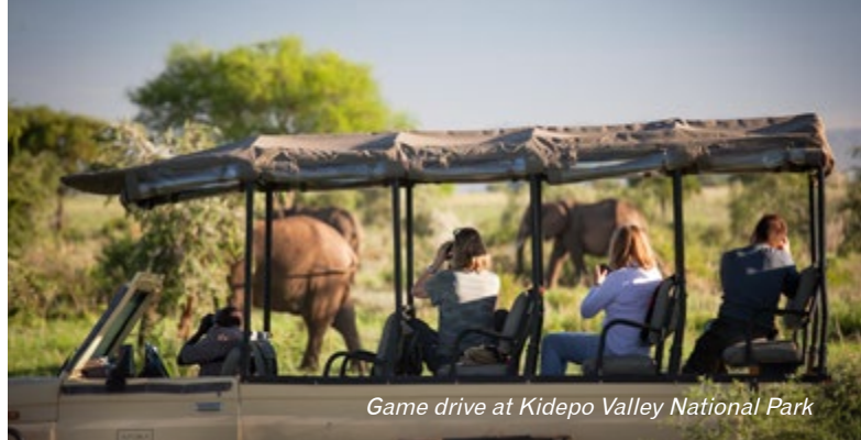
Game drive at Kidepo Valley National Park