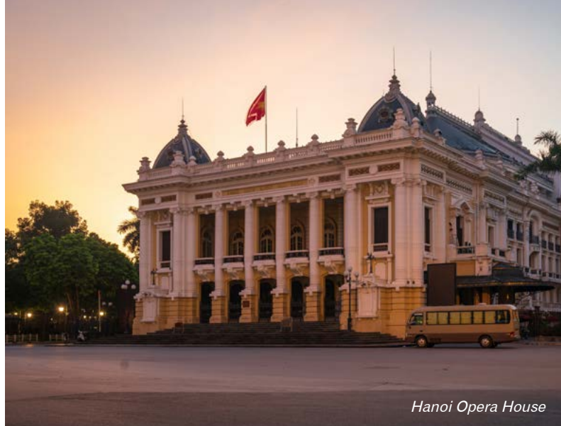
Hanoi Opera House