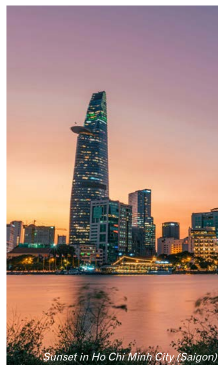
Sunset in Ho Chi Minh City (Saigon)

Lunch at Vietnam House. Visit the War Remnants Museum. Remainder of the afternoon at leisure and dinner under own arrangements.