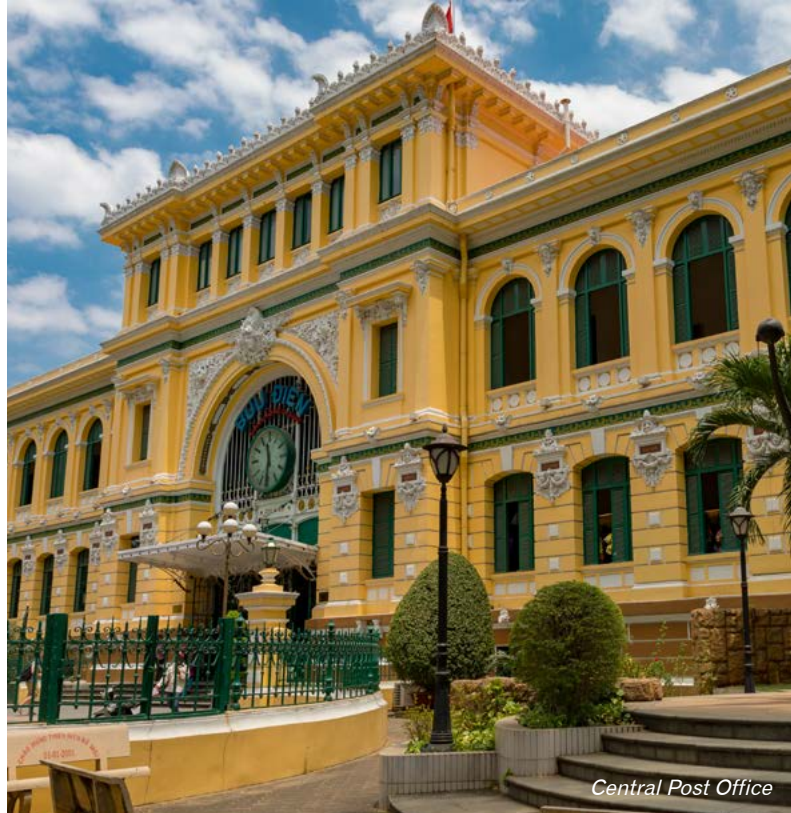
Central Post Office