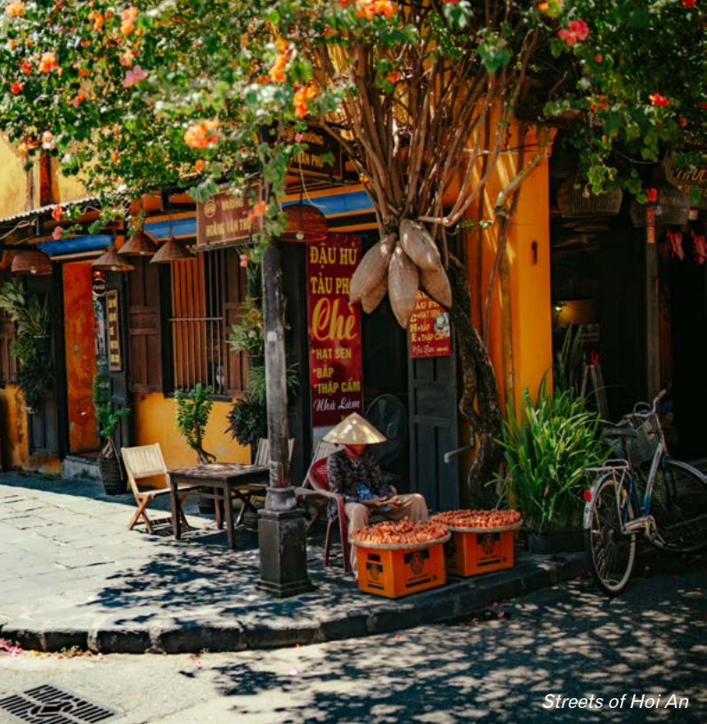
Streets of Hoi An