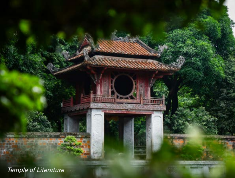
Temple of Literature