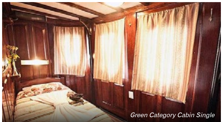
Green Category Cabin Single