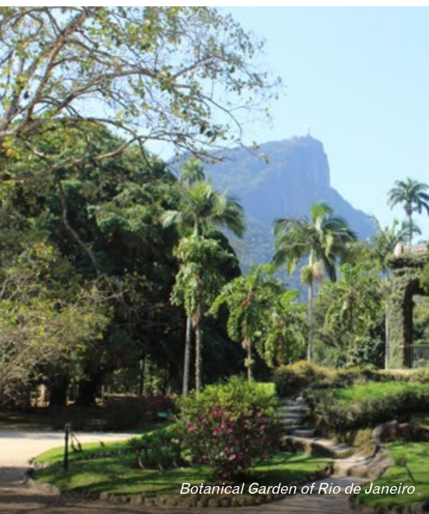
Botanical Garden of Rio de Janeiro