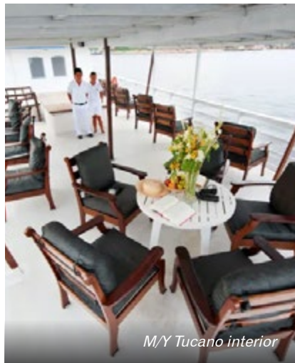
M/Y Tucano interior

Three days on board the M/Y Tucano exploring the Rio Negro. Lunch and dinner on board.