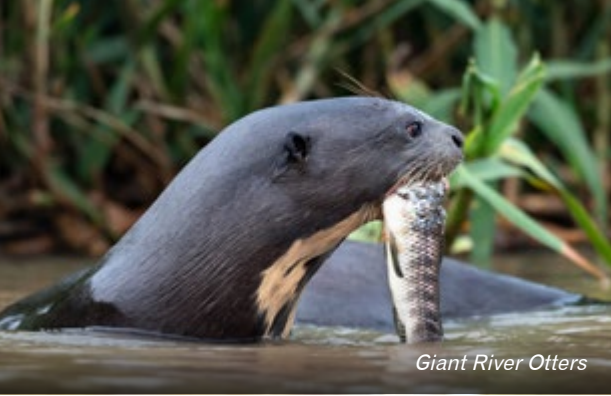
Giant River Otters