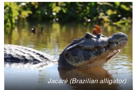
Jacaré (Brazilian alligator)

Hotel Gran Odara, a modern hotel close to the Mãe Bonifácia Park, where one night is spent. Dinner under own arrangements.