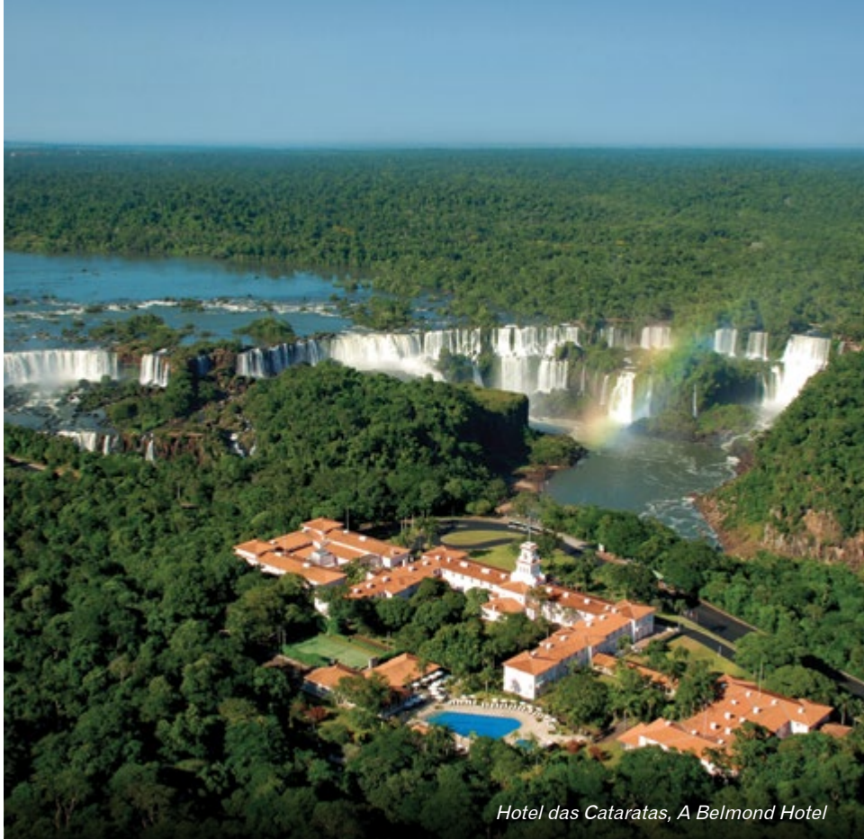
Hotel das Cataratas, A Belmond Hotel