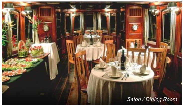
Salon / Dining Room