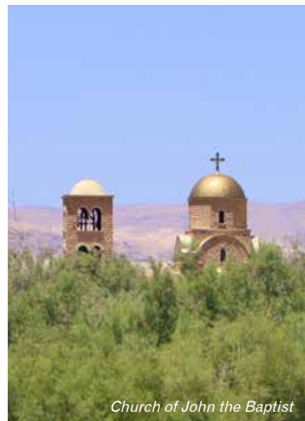
Church of John the Baptist

Lunch at The Basin Restaurant. Option to walk up to the Deir Monastery (800 steps) and back. Walk back down to the treasury and on to the site entrance. Return to the hotel. Dinner at the hotel.