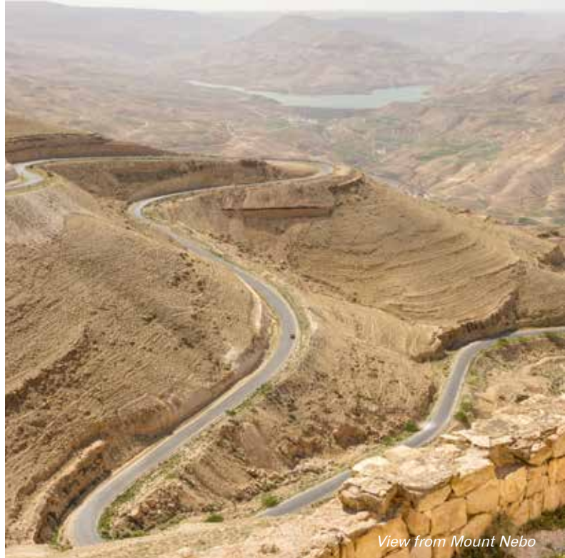
View from Mount Nebo