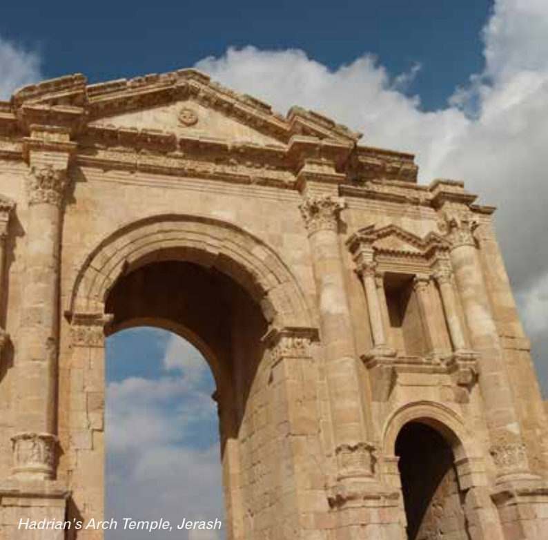
Hadrian's Arch Temple, Jerash