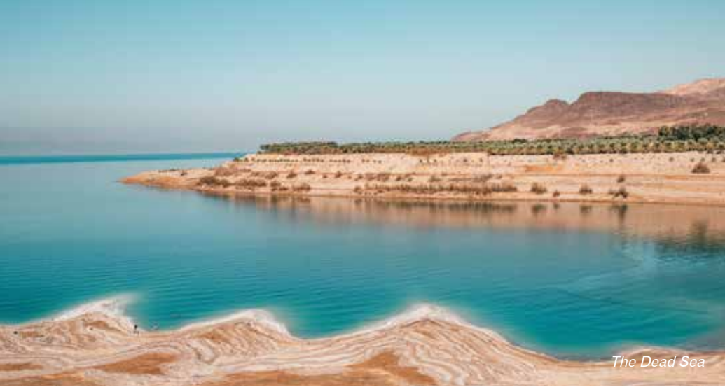
The Dead Sea